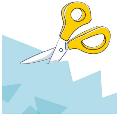
Figure 2 The Basel-City Kindergarten (Kindergarten, 2022)

Kindergarten classrooms are heterogeneous groups with children in the two-year age range. As a rule, they are carried out in two stages, that is, children in the first and second school years go to the same class together. Children start kindergarten with different individual experiences, different abilities and skills. Teachers record children's progress by observing children and talking to parents. They recognize strengths and