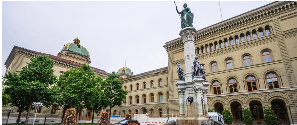
Figure 1 Swiss Federalism (Unifer, 2021a)

The pillar of the Swiss government system; rule of law, democracy, the social state and federalism. In Switzerland, the federal system is based on the 1848 Federal Constitution. There are 26 cantons, these are considered as states and the cantons are largely autonomous. Unless the Federal Constitution or federal law provides otherwise, federal duties are carried out, executed by the cantons. The building blocks of the Swiss federal state are neither various state theories nor a theoretical system shaped by constitutional law experts. Swiss Federalism is the product of two centuries of development evolution from small independent states to a single modern state. Switzerland, with its long tradition as a federalist state that has successfully redistributed power, has a wealth of experience to offer other countries (Unifer, 2021).