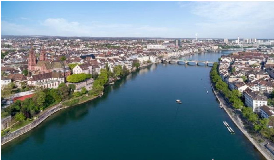
Figure 2 National Conference on Federalism 2021, Basel (Foederalismus 2021)

Every three to four years, the National Conference on Federalism brings together experts and practitioners from politics, business and public administration to examine Switzerland's unique system of government. Current challenges in the distribution of power between the federal government, cantons, municipalities and institutions are discussed. The conference aims to specify the requirements for federalism with a view to social changes and to consolidate the interaction. The National Conference on Federalism 2021 was dedicated to the topic of «Federalism and Dynamics» and took place on May 27/28 in the host canton of Basel-Stadt and due to the pandemic, the 2021 National Federalism Conference was held virtually (Foederalismus 2021).