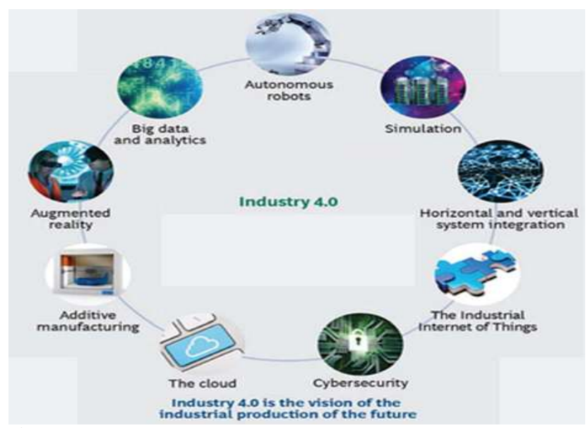
Figure 2 Nine Technologies for Industry 4.0.