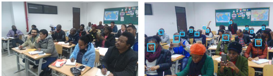
Figure 2 - 3

To verify the performance of the APIs, we compare the levels of emotions from APIs 4-digit decimal values with rounding off cut point at lower than 5 in the last digit. After removing some potential data specify problems including outliers, T-test, one-way, two-way ANOVA and Pearson's correlation coefficient were applied. The scores from the survey and APIs were performed in SPSS mac OS.