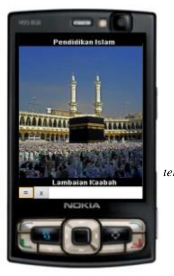
Figure 1 below shows the results of the mobile technology application design that has been developed. This mobile technology application was developed using the Learning Mobile Author version 4, which can be downloaded for free on the website. The mobile phones that support this mobile technology application for teachers includes Blackberry, Nokia, Samsung, HTC and mobile phones with Java ME 2.0 software. The design and development of mobile technology application were based on the ADDIE instructional model because it is suitable to any kind of learning.