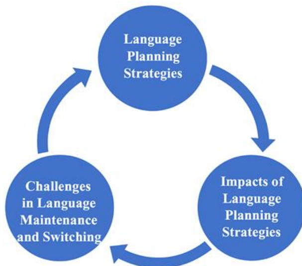
Figure 2 Themes of the interviews