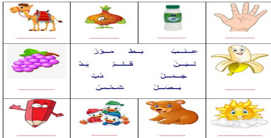
Figure 3 Sample of writing test

Speaking Test. The aim is to assess child's ability to speak with the help of pictures. Word are presented and selected from the students' book to ensure that those words are familiar to children, was designed particularly for this study. A card with the pictures was presented (see figure 4). The child is asked to say what is happening in each picture. This is done individually. The corrected chosen picture is given one point. While the incorrect is given zero. Raw scores were used for analysis. For this task, good reliability (Split-half reliability coefficient = .88) was found.