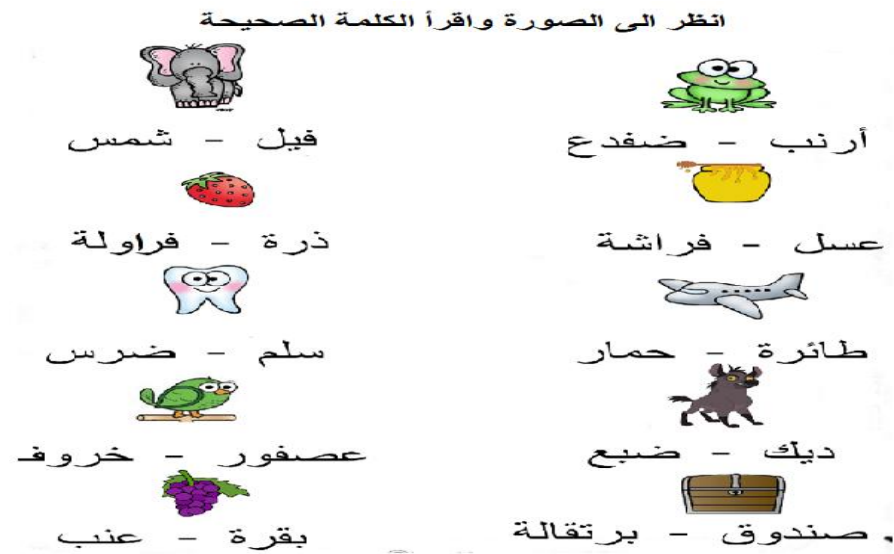
Figure 5 Sample of reading test

Reading Test. The aim is to assess child's ability to read with the help of pictures. Word are presented and selected from the students' book to ensure that those words are familiar to children, was designed particularly for this study. A card with the pictures was presented (see figure 5). The child is asked to the words that suits each picture. This is done individually. The corrected chosen picture is given one point. While the incorrect is given zero. Raw scores were used for analysis. For this task, good reliability (Split-half reliability coefficient = .88) was found.