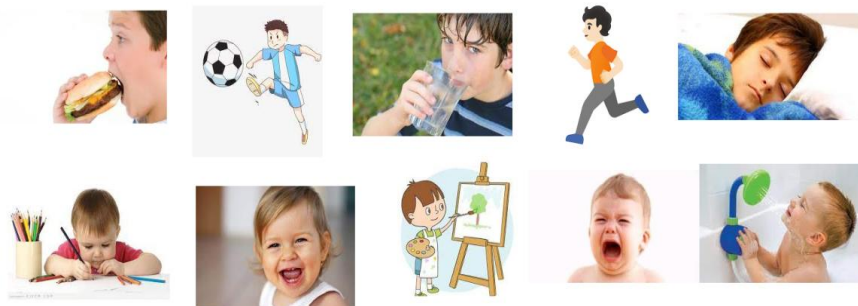
Figure 4 Sample of speaking test