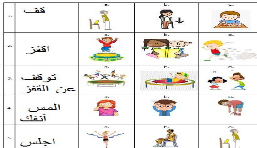
Figure 2 Sample of listening test

Listening Test. The aim is to show how much the child understands spoken Arabic. A list of words (on the left) and multiple choice picture that only one represents the word are presented and selected from the students' book to ensure that those words are familiar to children, was designed particularly for this study. Two cards with the words and pictures was presented (see figure 1). The child is asked to circle the correct picture of the spoken word he listens to. This is done individually. The corrected chosen picture is given one point. While the incorrect is given zero. Raw scores were used for analysis. For this task, good reliability (Split-half reliability coefficient = .89) was found.