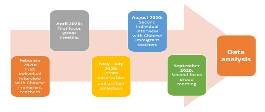
Figure 2 Timeline of the data collection

To gain insights into Chinese immigrant teachers' motivations for teaching HL, the researcher collected data from February 2020 to September 2020 to find support evidence from multiple sources (Creswell, 2012; Merriam & Tisdell, 2016). The primary data sources of this study were 120 semi-structured one-on-one interviews and 24 focus group interviews. Figure 2 summarises the timeline of the data collection process.