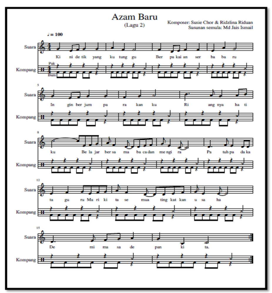
Figure 1 Score coordination of singing and kompang playing