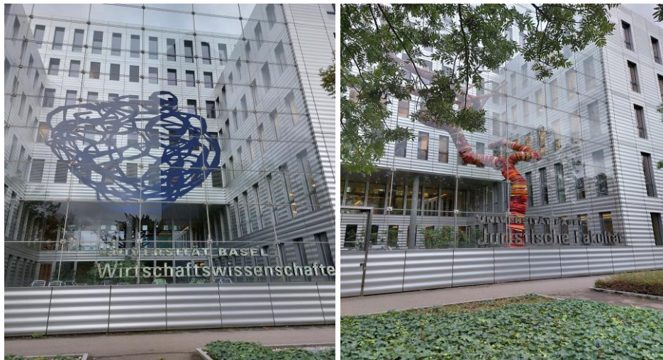
Figure 2 Views from faculties