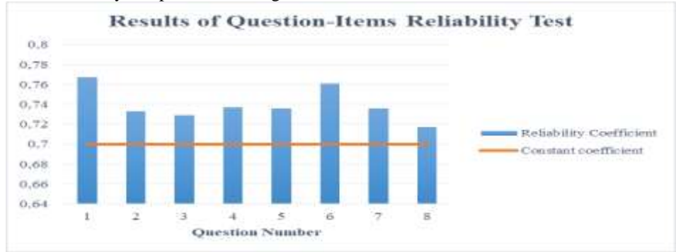
Figure 2 Results of question-items reliability test

The instrument is declared reliable if it has a reliability coefficient of 0.7 or greater. Thus, if the reliability coefficient is lower than 0.7, it is declared unreliable and vice versa. The reliability test result of the whole test items is 0.765. The results of questionitems reliability test presented in Figure 2.