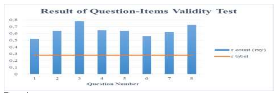
Figure 1 Results of question-items validity test

Based on Figure 1, the significance value of the instrument test validation is 5%, so all critical-thinking skills test items are valid. The item is declared valid if r count (r_{xy}) is greater than r table. Based on the table of product-moment values of Sugiyono (2011), with a significance level of 5% and the number of students (N) of 50, the r table value of 0.279 is obtained.