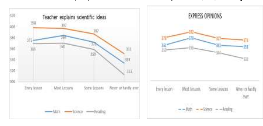
Figure 1 PISA scores according to teacher characteristics.

help in most lessons (354), teachers helped in some lessons (371), teachers express opinions in most lessons (356), teachers explained scientific ideas in most lessons (370), discussed with students (367), and discussed students' questions (369) in every lesson.