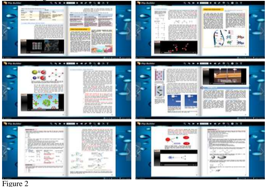
Contents in Multi-Representation based E-Book

The explanation in the e-book provided a macroscopic, microscopic and symbolic description to help the reader comprehend the studied concepts. Related images were given in the macroscopic aspect, while the video was added in the microscopic aspect to ease the readers' comprehension of the conveyed explanation. The symbolic aspect was made as easy as possible through an explanation of a basic theory, for example, determination of the polarity of the covalent molecule was symbolised as a man being pulled by a rope and the difference in electronegativity was symbolised by the force of attraction (Figure 2).