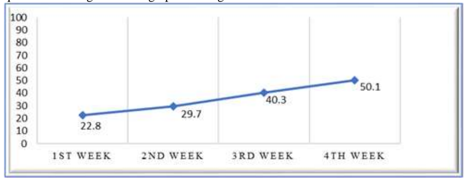
Figure 4 Speech Flow

The speech stream level of learners' oral performance was interpreted based on how successfully learners were controlling a set of hindrances to the speech speed and natural flow. This effectiveness of speech stream dwelled in lowering the number of unnatural pauses, of inhibition remarks, of hesitations, of self-corrections, and of repetitions. These qualities were coded and then thematically analysed to encode the qualitative data gathered as graphed in Figure 4.