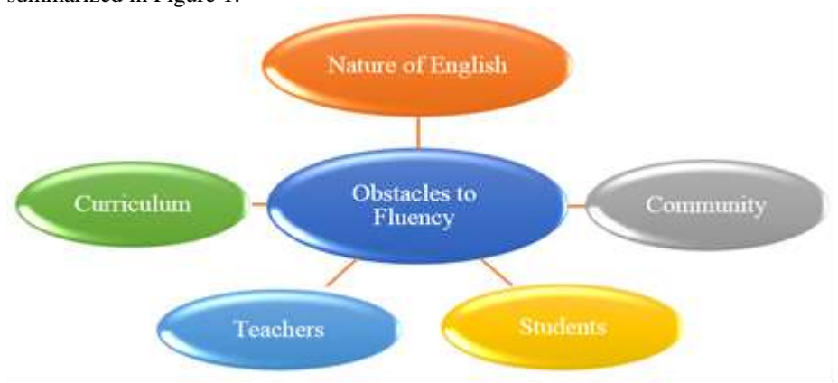
Figure 1 Obstacles to Fluency

Language learners struggle against a group of factors that are reflected in obstacles to the teaching of English as Foreign Language (TEFL), leading to restricting the students' oral production in general and speaking fluency in particular. These factors are summarized in Figure 1.