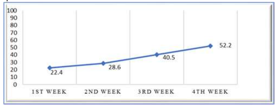
Figure 5 Fluency Overall Progress

Students' overall speaking progress in terms of fluency was concluded by calculating the average improvement in the previous three themes which was based on the quality of utterances, stress, rhythm and intonation tendency, and speech flow within each week in order to identify the real overall progress that the participants could achieve in terms of oral fluency over the 4-week delivery of language teaching mediating L2. On learners' fulfillment of the previous criteria, a participant was labelled a 'fluent' non-native speaker.