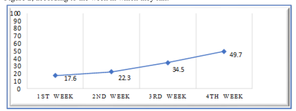
Figure 2 Quality of Utterances

of words per minute, the number of words per analysis of speech unit, and the number of clauses per minute. Specifically, utterances quality refers to the chunks of the language used; how meaningful, and how close to native-like utterances. Target learners' utterances quality was recorded over a period of four weeks to explore in which direction it was going on. Students' speech was first recorded on the checklist regarding the quality of responses and interaction. Then, the general tendency of the data obtained for the quality of utterances was visualized in terms of improvement percentages, as in Figure 2, according to the week in which they fall.