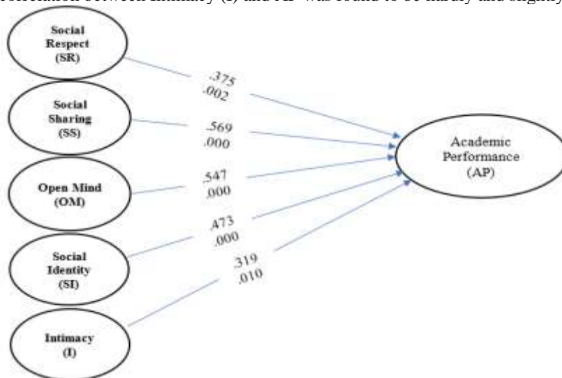
Figure 2 OSP Patterns with Significant Relationships with AP

Figure 2 depict the outcome of OSP and AP Pearson Correlation Coefficient which indicate significant correlation between SR, SS, OM and SI with AP. However, the correlation between Intimacy (I) and AP was found to be hardly and slightly significant.