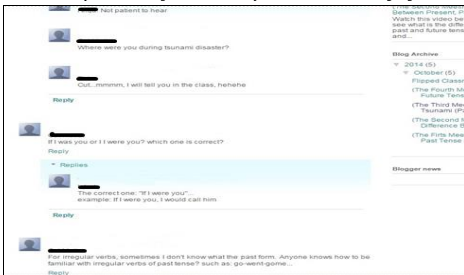
Figure 3 Students' online interaction on the Blog outside of the class times

In term of interaction, most students acknowledged that the flipped classroom instruction could help in establishing a good interaction with peers in the classroom and after the class hours. While in the class activities, students could interact through face-to-face groups working together and while outside the class hours, they could interact online on the Blog by asking and answering questions. In this case, problem-solving and exchanging ideas were not only established through face-to-face during the class hours but also online outside of the class. The survey result also revealed that 85% ( M = 4.14 , SD = .863 ) of students declared that the flipped learning instruction enhanced students' peer interaction among students in-class and out-of-class times. Also, 81 % ( M = 4 , SD = .733 ) of students believed that using a Blog made them easier to interact with the others outside of the class. Observation on the Blog also shows that students actively interacted with peer to exchange idea and solve problem, see the following Figure 3: